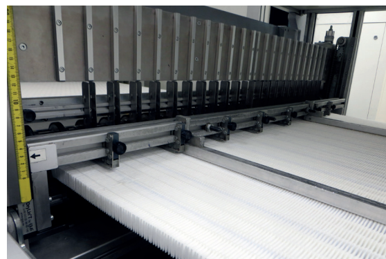
MANN+HUMMEL Air Filtration Americas Cleanroom production area