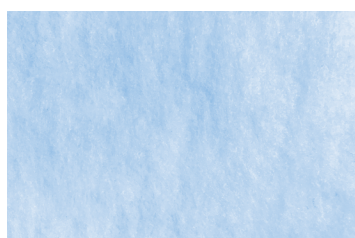
Close-up of polyester media